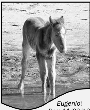
Eugenio! Born 11/09/13