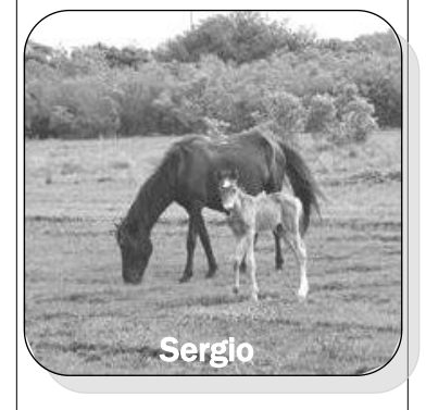
Sergio was the second new foal of the spring!